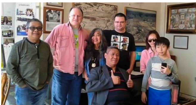
Union City Historical Museum members and volunteers.