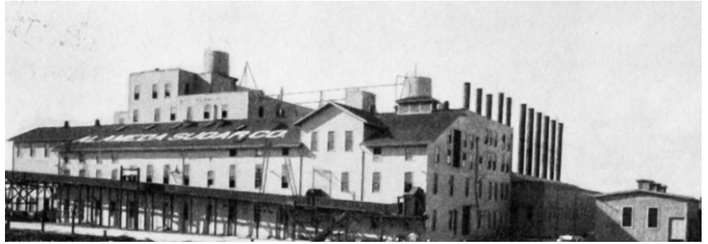
The Alameda Sugar Mill at Alvarado circa 1905.

The sugar mill expected the 1913 crop would be shipped to the Alvarado mill and at the end of the year the erection of the new mill would be commenced at Meridian and would be ready to handle the 1914 crop when the entire 12,000 acres was expected to be producing beets. The Alvarado mill would then be dismantled.